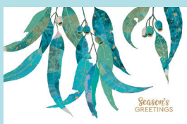
Floral Greetings Code: AU304 Gold foil