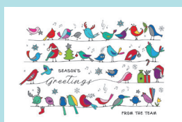
Tweet from the Team Code: FE423 Silver foil