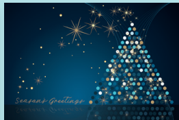
Sparkling Tree Code: TR365 Gold foil