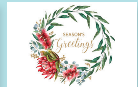
Australian Wreath Code: WR496 Gold foil