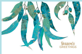
Floral Greetings Code: AU304 Gold foil