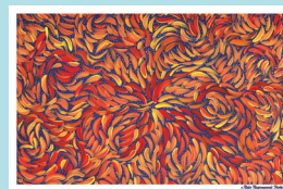
Bush Banana Dreaming Code: AU400