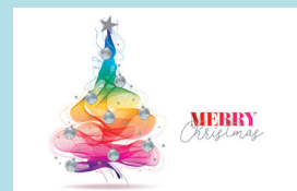
Shimmering Tree Code: TR481 Silver foil