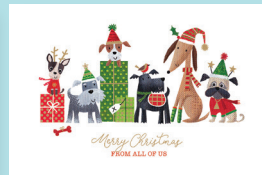
Puppy Team Code: FE394 Gold foil