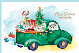
Christmas Delivery Code: FE270 Gold foil