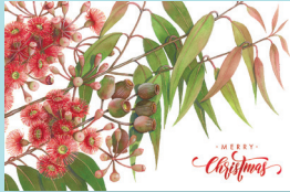
Gum Blossom Greetings Code: AU399