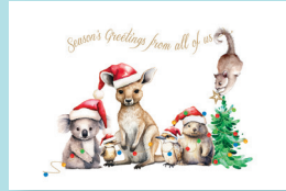
Aussie Team Code: AU415 Gold foil