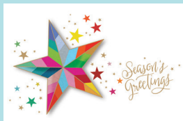
Shining Star Code: ST483 Gold foil