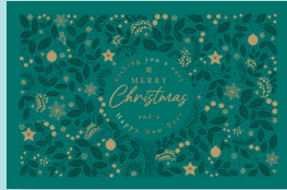
Christmas Decorations Code: FE411 Gold foil