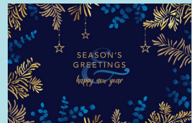
Twinkling Greetings Code: FE442 Gold foil