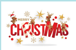
Festive Reindeer Code: FE476 Gold foil