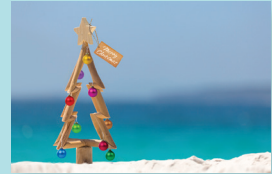
Beach Christmas Code: FE448