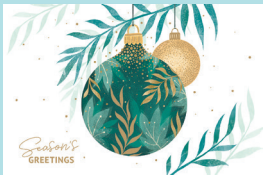
Eucalyptus Greetings Code: BA457 Gold foil