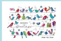
Tweet from the Team Code: FE423 Silver foil