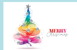
Shimmering Tree Code: TR481 Silver foil