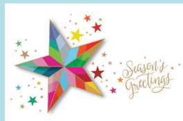
Shining Star Code: ST483 Gold foil