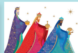
Magnificent Kings Code: RE333 Gold foil