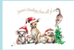
Aussie Team Code: AU415 Gold foil