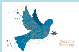
Peace Dove Code: DO444 Gold foil