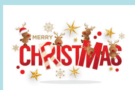
Festive Reindeer Code: FE476 Gold foil