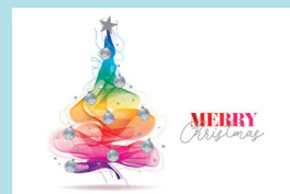
Shimmering Tree Code: TR481 Silver foil