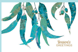
Floral Greetings Code: AU304 Gold foil