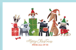
Puppy Team Code: FE394 Gold foil