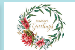
Australian Wreath Code: WR496 Gold foil