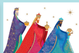
Magnificent Kings Code: RE333 Gold foil