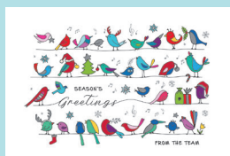
Tweet from the Team Code: FE423 Silver foil