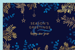
Twinkling Greetings Code: FE442 Gold foil