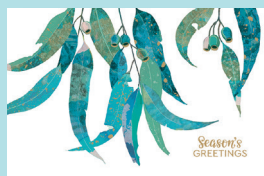
Floral Greetings Code: AU304 Gold foil