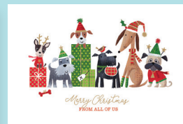
Puppy Team Code: FE394 Gold foil