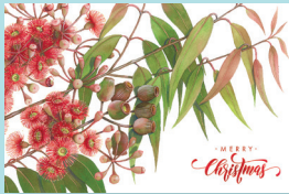
Gum Blossom Greetings Code: AU399