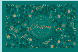
Christmas Decorations Code: FE411 Gold foil