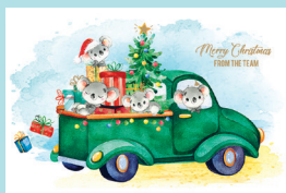
Christmas Delivery Code: FE270 Gold foil