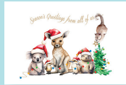
Aussie Team Code: AU415 Gold foil