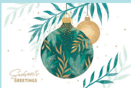
Eucalyptus Greetings Code: BA457 Gold foil