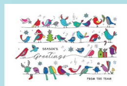
Tweet from the Team Code: FE423 Silver foil