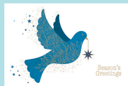
Peace Dove Code: DO444 Gold foil