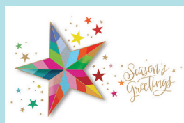
Shining Star Code: ST483 Gold foil