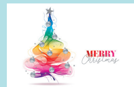
Shimmering Tree Code: TR481 Silver foil