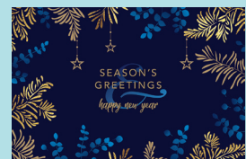
Twinkling Greetings Code: FE442 Gold foil