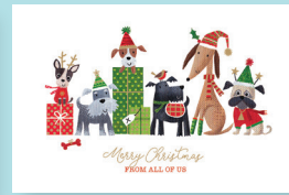
Puppy Team Code: FE394 Gold foil