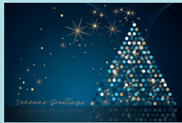
Sparkling Tree Code: TR365 Gold foil