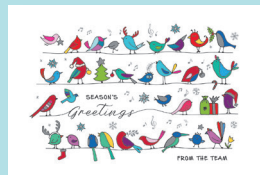
Tweet from the Team Code: FE423 Silver foil