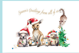
Aussie Team Code: AU415 Gold foil