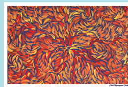
Bush Banana Dreaming Code: AU400