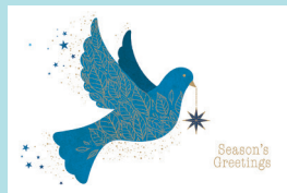
Peace Dove Code: DO444 Gold foil