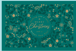
Christmas Decorations Code: FE411 Gold foil