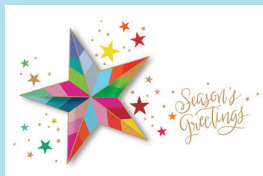
Shining Star Code: ST483 Gold foil