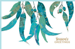
Floral Greetings Code: AU304 Gold foil