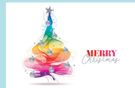
Shimmering Tree Code: TR481 Silver foil