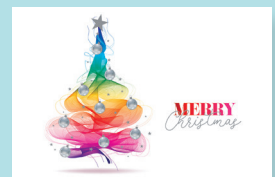
Shimmering Tree Code: TR481 Silver foil