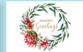
Australian Wreath Code: WR496 Gold foil